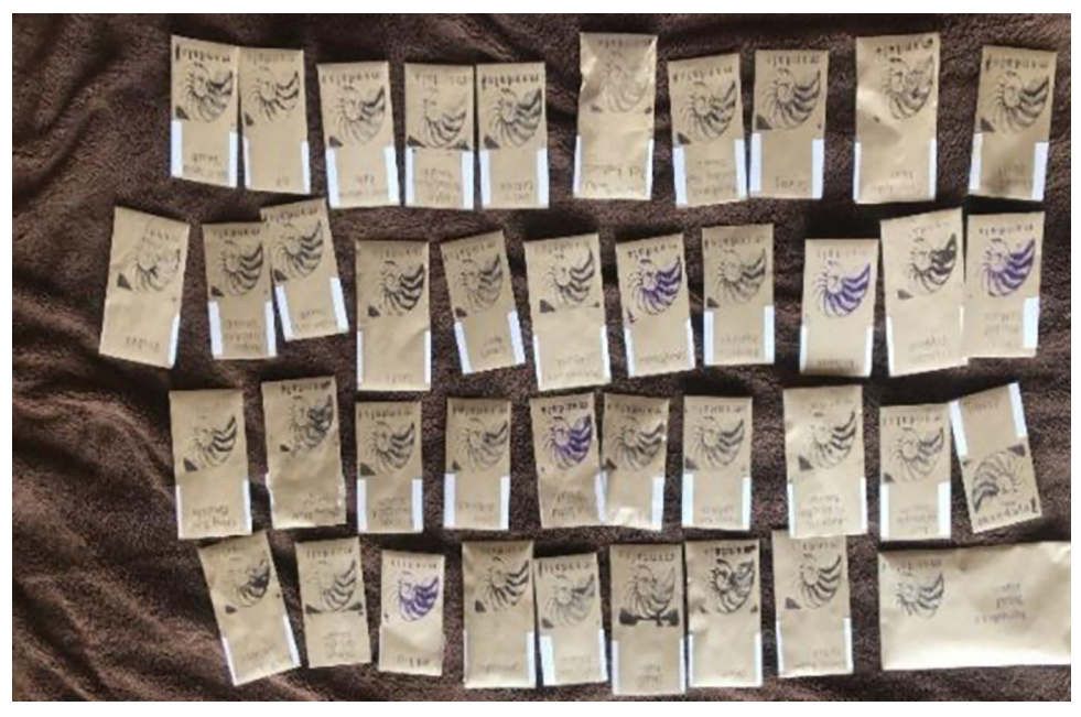
Fig 1. Vegetable seeds packaged for exchange by a CTTFGI representative. https://doi.org/10.1371/journal.pstr.0000038.g001

As a result of the lessons and seed-sharing activities, new farms were started during the pandemic at community and household level (Fig 1). Observations of the CTTFGI group by SA recorded 54 new gardens across 20 different communities created by participants between 15 May and 1 August 2020 (77 days). Some of the farms were created in Elsie's River, Dunoon, Gugulethu, Mitchells Plain, Nyanga, and Simon's Town. Community gardens that facilitated this expansion are listed in Table 2. The farming methods used were holistic and incorporate sustainable farming methods. The farms occupied less space and used less water and nutrients. Some of the gardens were created in underutilised urban areas such as vacant/non-developed plots, street curbs, educational facilities, and unofficial dumping sites. This was a conscious effort to reclaim urban spaces as shared by the CTTFGI administrator: