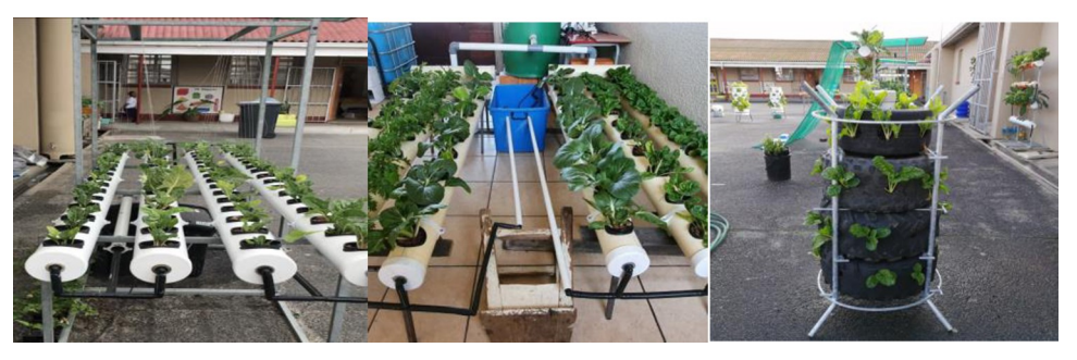
Fig 2. School garden at Facreton using a GroPro and an upcycled vertical farm. https://doi.org/10.1371/journal.pstr.0000038.g002

Besides the holistic educational benefits, the Facreton Primary School garden also contributed towards feeding the school children. In May 2020, the school, whose feeding programme is part of the National School Nutrition Programme, was invited to help with community feeding initiatives in the Facreton area. The school provided community meals three days a week