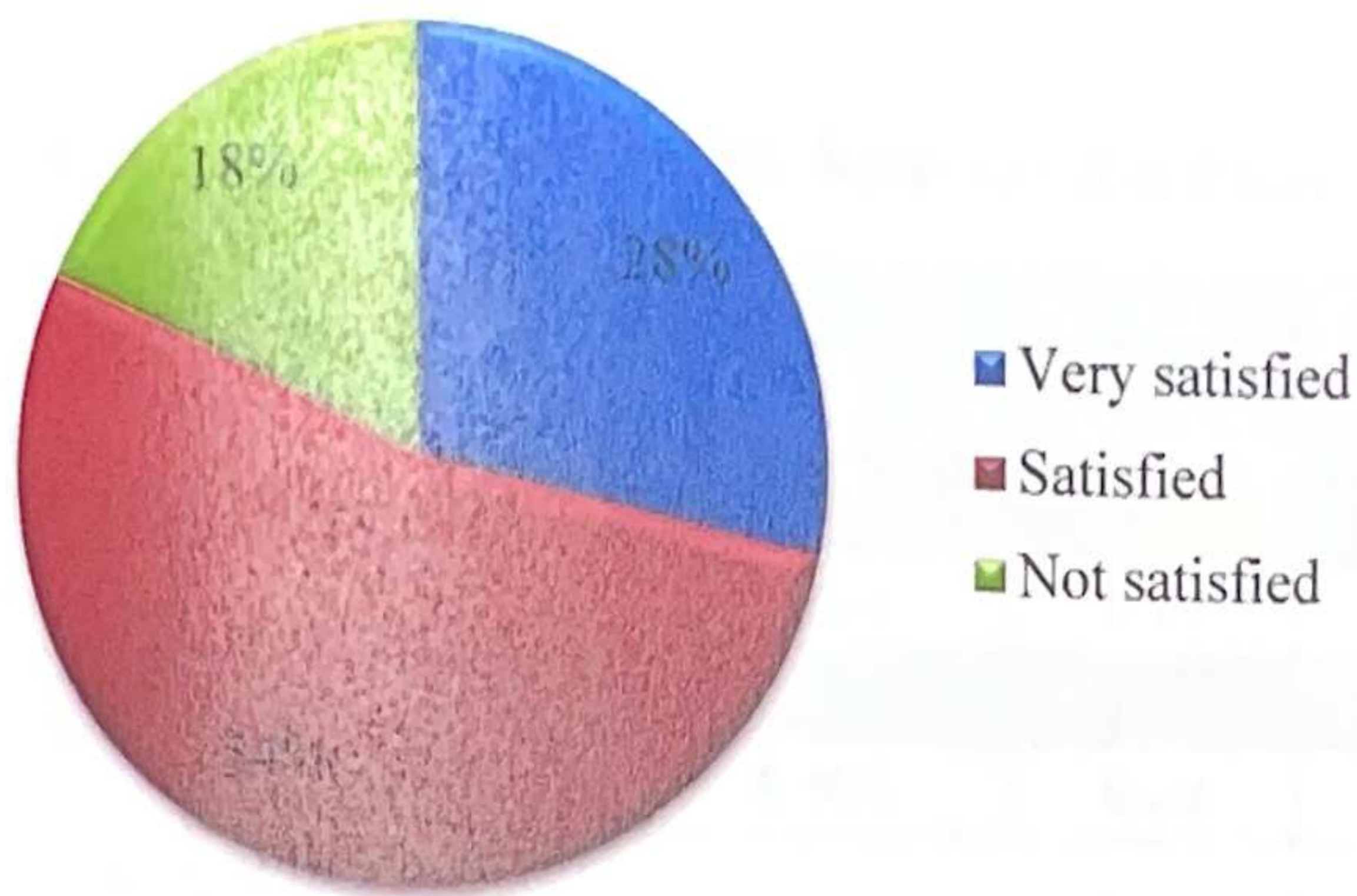
Figure1. Respondents Level of Satisfaction